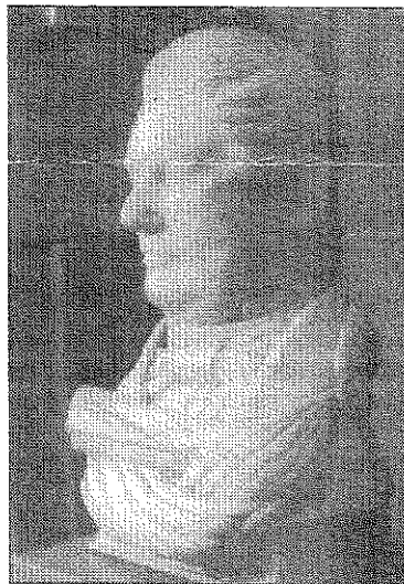
A bust of Millard Fillmore is located just inside the front entrance of Buffalo City Hall. He was Cayuga County's only former president and later made his home in Buffalo.